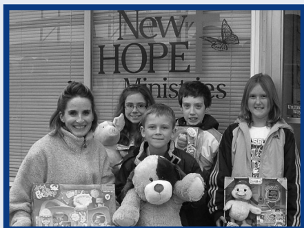
Students from Northern Elementary School in Dillsburg deliver a toy donation to New Hope.