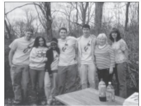
"Team Messiah students volunteer at the Dover Center."